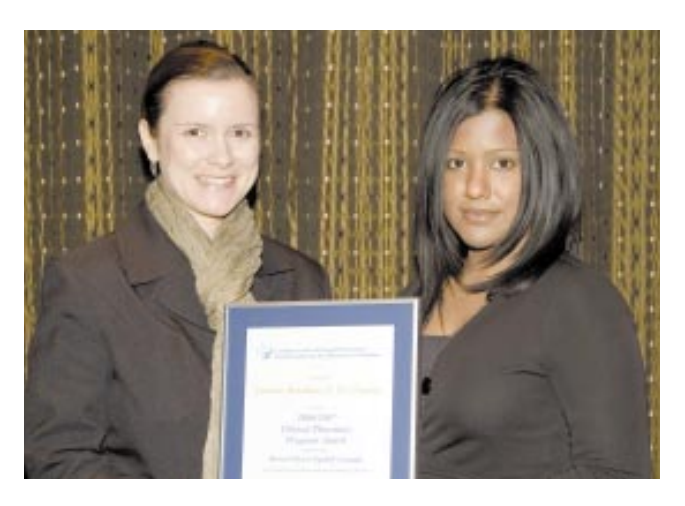
Clinical Pharmacy Program Award