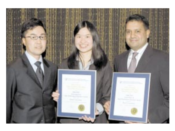
Innovation in Safe Medication Practices Award Baxter Corporation

Extent of Agreement in Gentamicin Concentration Between Serum that is Drawn Peripherally and from Central Venous Catheters