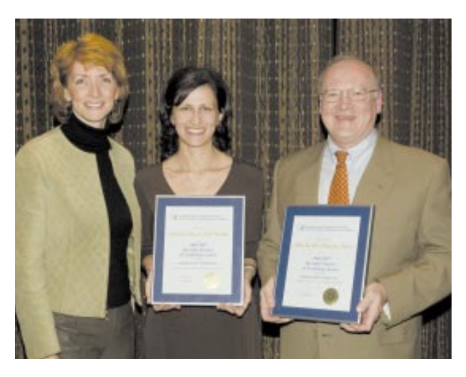
Specialty Practice in Cardiology Award

The Safety and Effectiveness of Antiretrovirals in Pregnancy