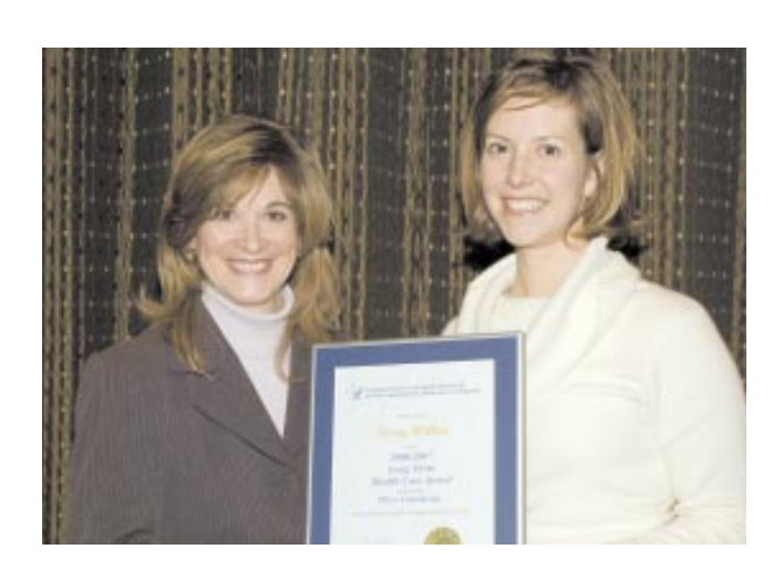
Long-Term Health Care Award

Pharmacist Medication Assessments in a Surgical Pre-Admission Clinic (SPPACE)