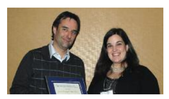
Teaching, Learning, and Education Award

Verification of ImatiNib Cost-Effectiveness in Advanced Gastrointestinal Stromal Tumor in British Columbia