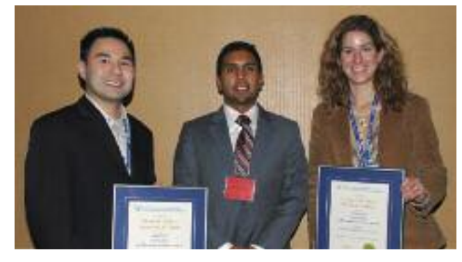
Specialties in Pharmacy Practice Award

Pharmacokinetics of Vancomycin and Gentamicin in Pediatric Patients on Extracorporeal Life Support