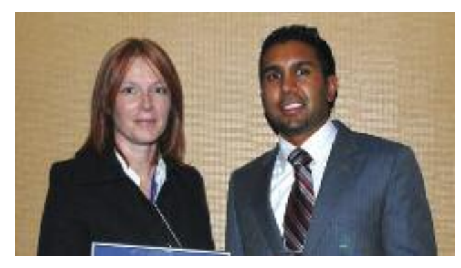
Safe Medication Practices Award

Improving Risk Management with the Development of a Best Evidence-Based, Provincial Chemotherapy Preparation and Stability Chart